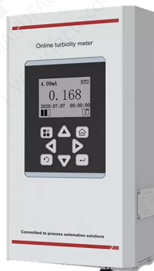
Online turbidity analyzer