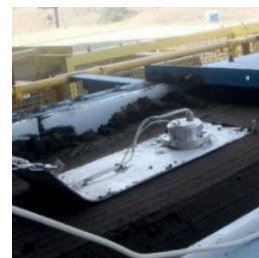
Coal and coke