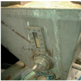
Wheat / Maize