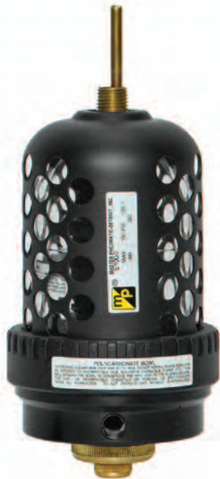
Model Shown: E100-2